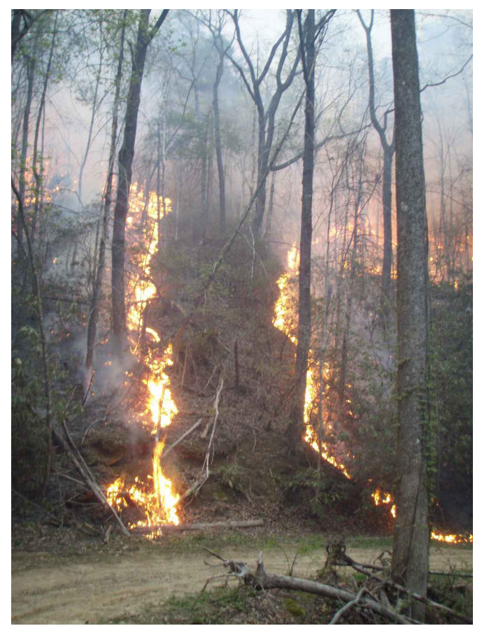
A fire we conducted in a hardwood forest in the mountains

Fire can also be used to help regenerate certain hardwoods. When regenerating a site after a timber harvest or natural disaster, oaks along with other hardwoods and pine will sprout back. The oaks will focus on root development and storing starches there. Yellow poplar, red maple, other hardwoods along with pines, will focus on above-ground growth. A fire though the stand after things have grown back will knock everything back to the ground, but only the oaks will have enough food stored up to sprout back. The other hardwoods and pines have very little carbohydrates stored and can not compete with the oaks when resprouting after a fire kills everything above ground. This technique has been used most successfully in the Piedmont.