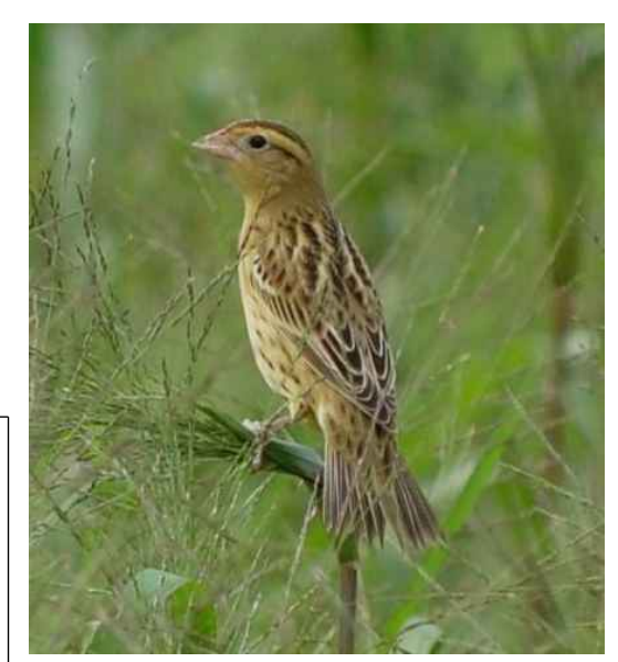
by B Bauer, at Nemours Plantation / Sept 2015 non-breeding ♂ or ♀ Bobolink on rice (They look near-identical when here.)

The Southern flying squirrel or assapan (G. Volans), is found in the Eastern half of North America, from ME to FL. The flying squirrels that live in the north are larger than the ones that live in the south. The Southern flying squirrel has graybrown fur on top with darker flanks and a cream color underneath. They have large dark eyes and a flat tail. The fury membrane cape that extends from each side of the body, from the front ankles to the back ankles, is called a patagium. That is what they use to glide through the air and it is also used as a parachute to land. (Base jumpers have developed their suits to mimic the flying squirrel.) ....continued on page 4