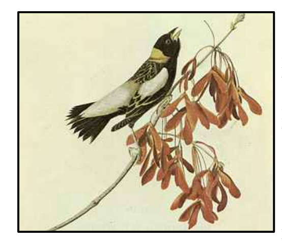
by JJ Audubon, Birds of America / c.1838 breeding male \mathcal{F} Bobolink on elm.